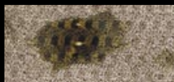
UNTREATED FABRIC ABSORBS SPILLS & STAINS