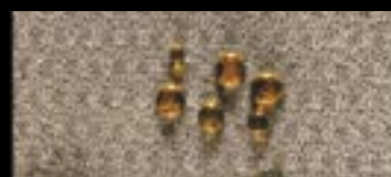
LIQUIDS BEAD UP ON TREATED FABRIC