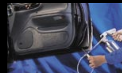
Using existing body holes, fogging spray application penetrates hard-to-reach cracks and crevices, providing maximum protection from inside out rust-through.