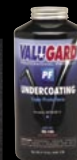
Treated surface is sealed and protected from corrosive elements.